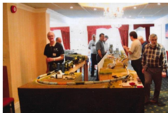
Black Diamonds at The Connaught Hotel, 2009