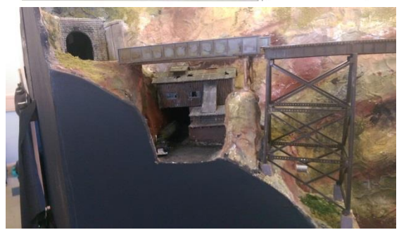
(Corner module on AMRG N layout)

Now there is time for a change. Inspired by a book about changing Chicago, I discovered the buildings of the "Central Manufacturing District." One of these big brick factory buildings would fit well on the undeveloped land.